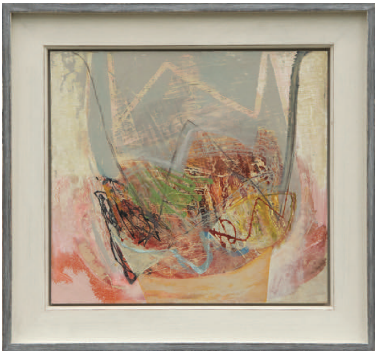
12. Farm Tracks acrylic on board 40.5 x 44cm