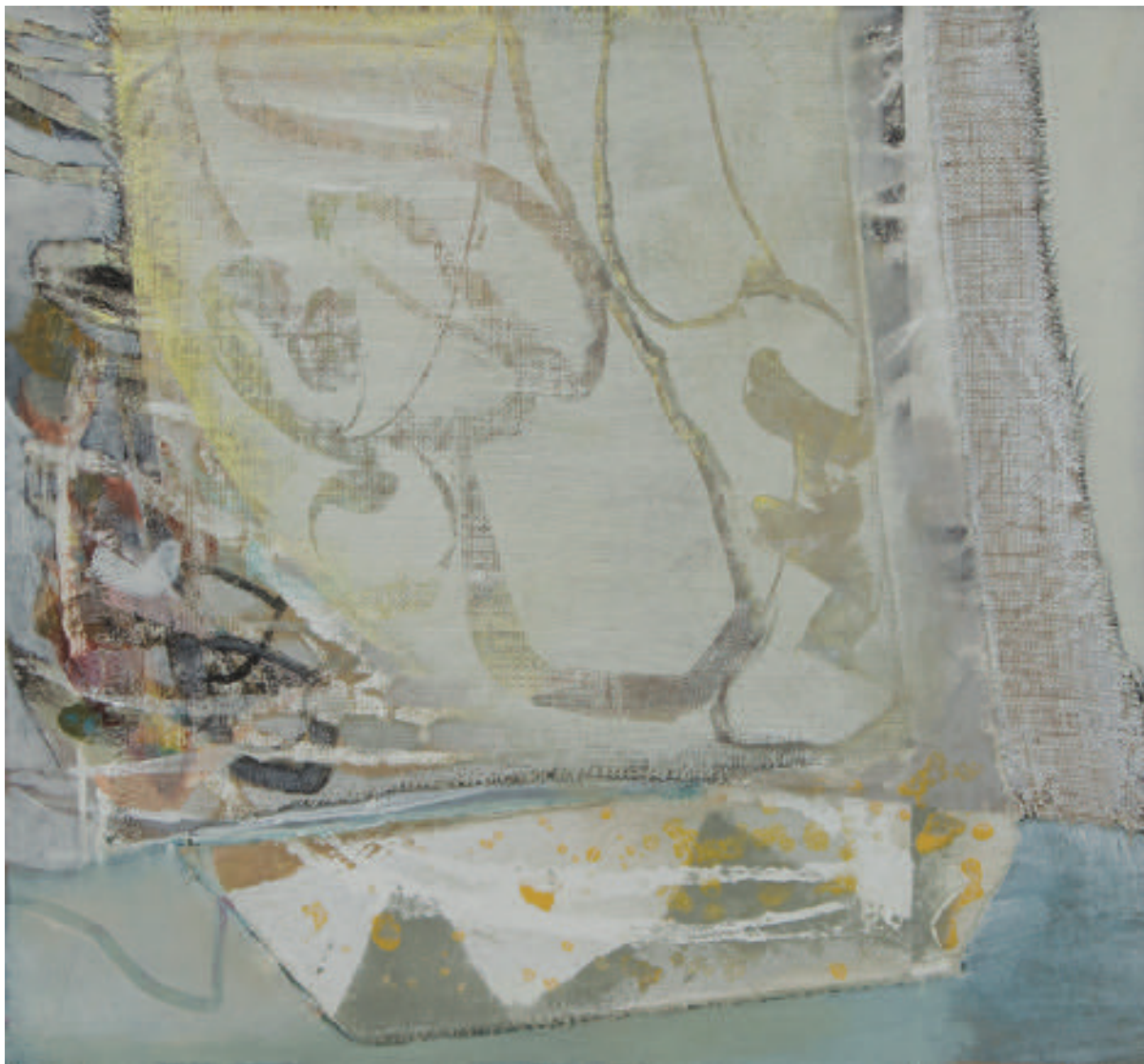
8. Spoor acrylic on board 59 x 64cm