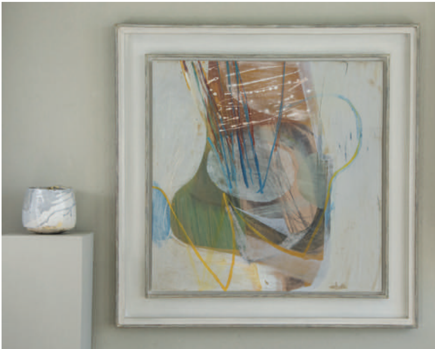
9. Wind Whistle acrylic on board 69 x 69cm