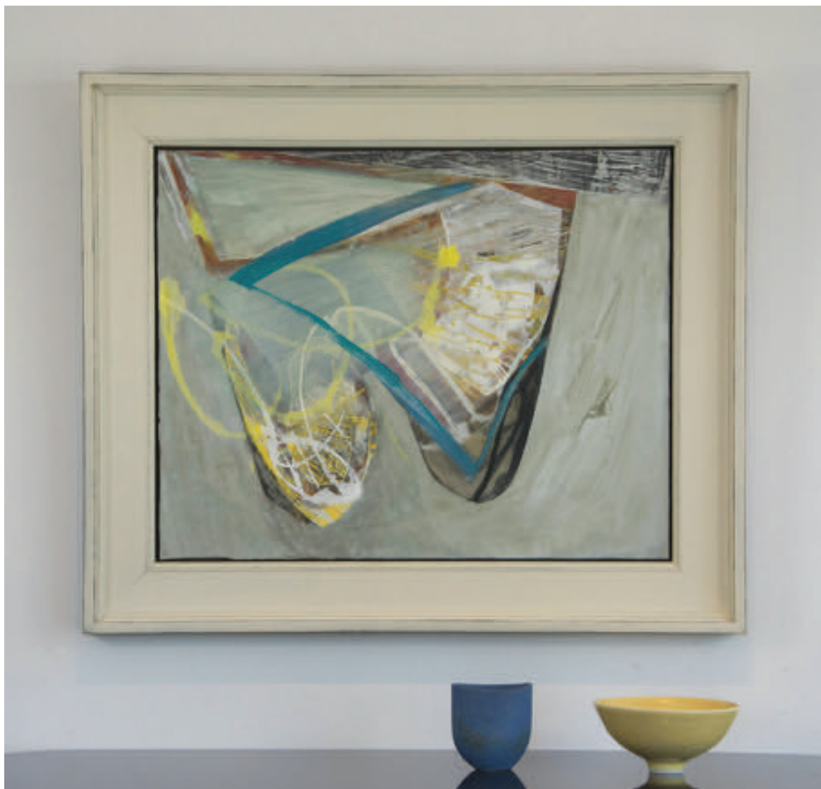
21. Deep acrylic on canvas laid on to board 40.5 x 51cm