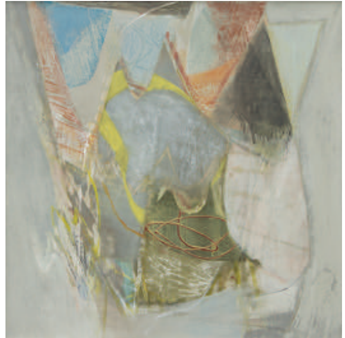
11. Settlement acrylic on board 69 x 69cm