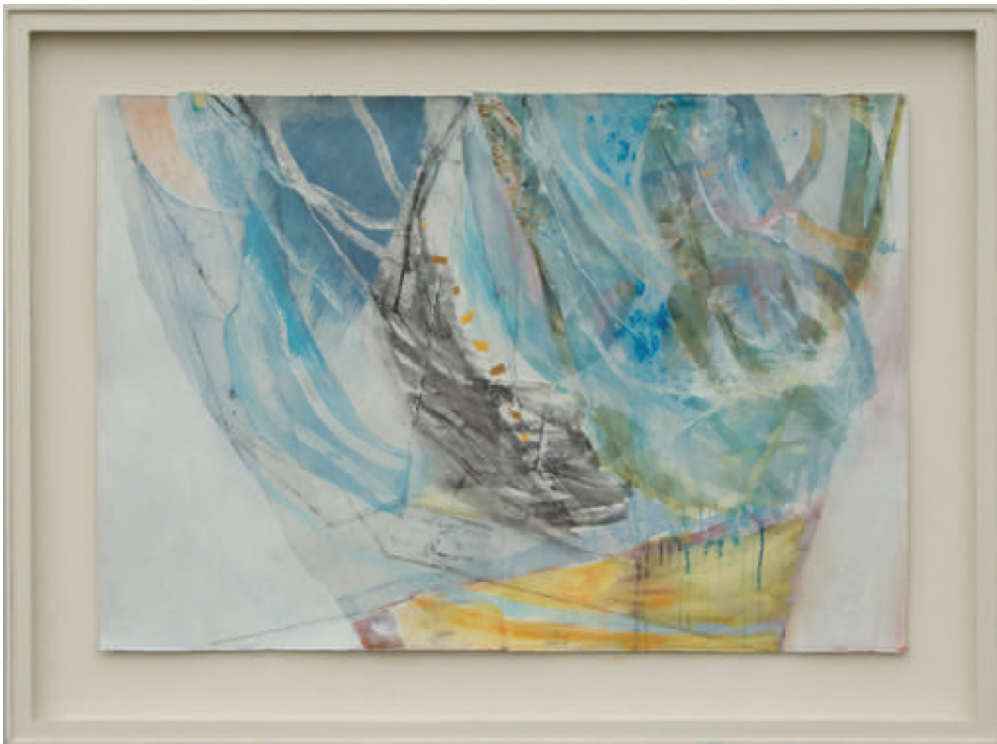
14. Evening Snorkel acrylic and collage on paper 77 x 112cm