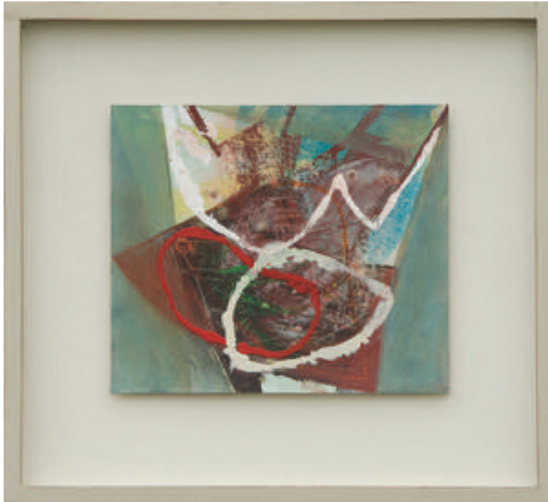
24. Reflected Red acrylic on board 24 x 28cm