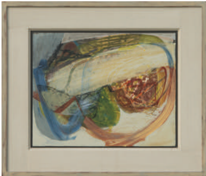
6. Ramble acrylic on board 30 x 38cm