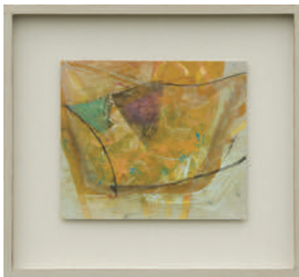
3. Two Nets acrylic on board 24 x 28cm