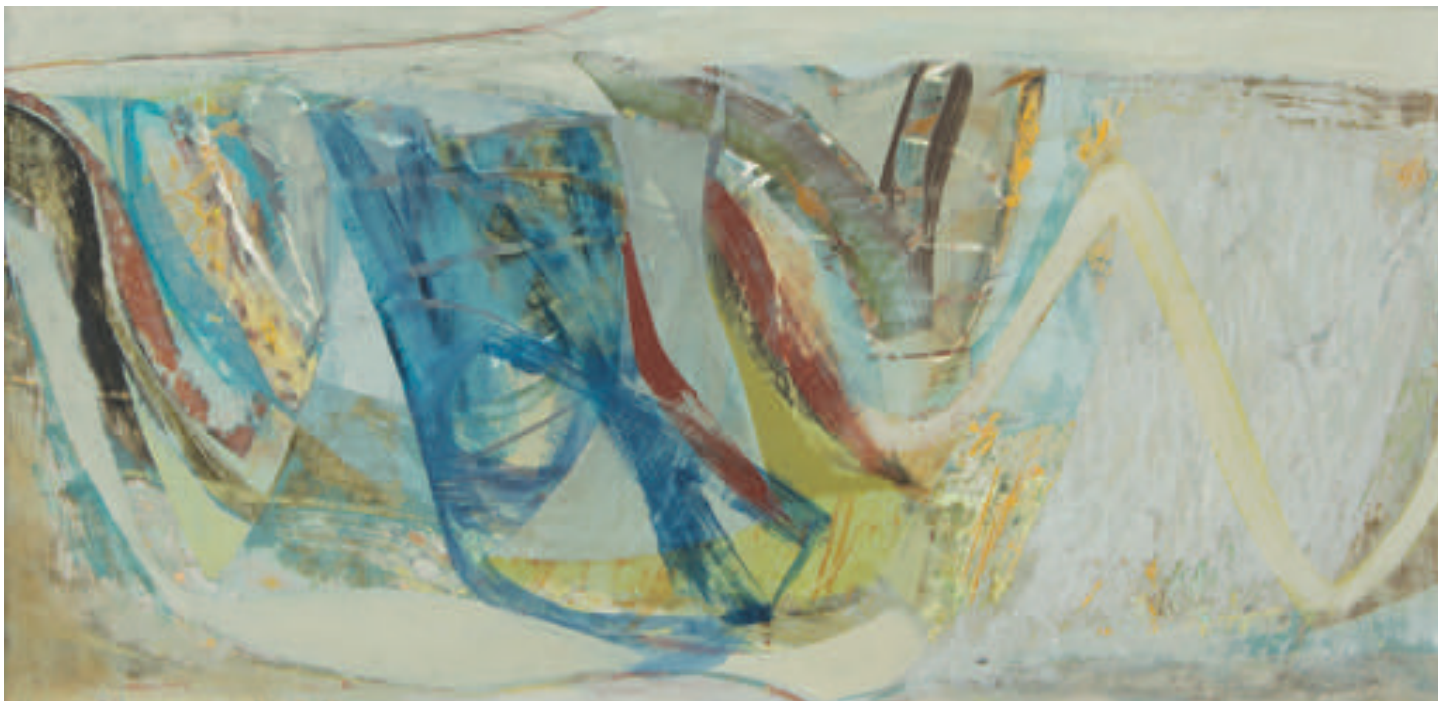
15. GR8 acrylic on canvas laid on to board 63 x 130cm