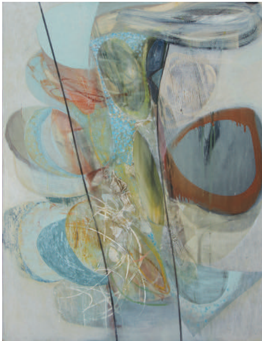
22. Grey Lines acrylic on canvas 138 x 107cm