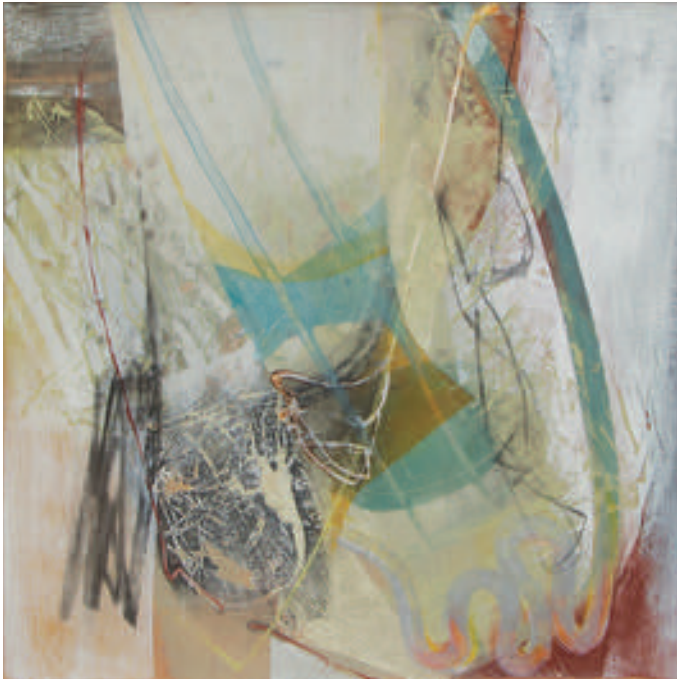
10. Dust Devil acrylic on board 69 x 69cm