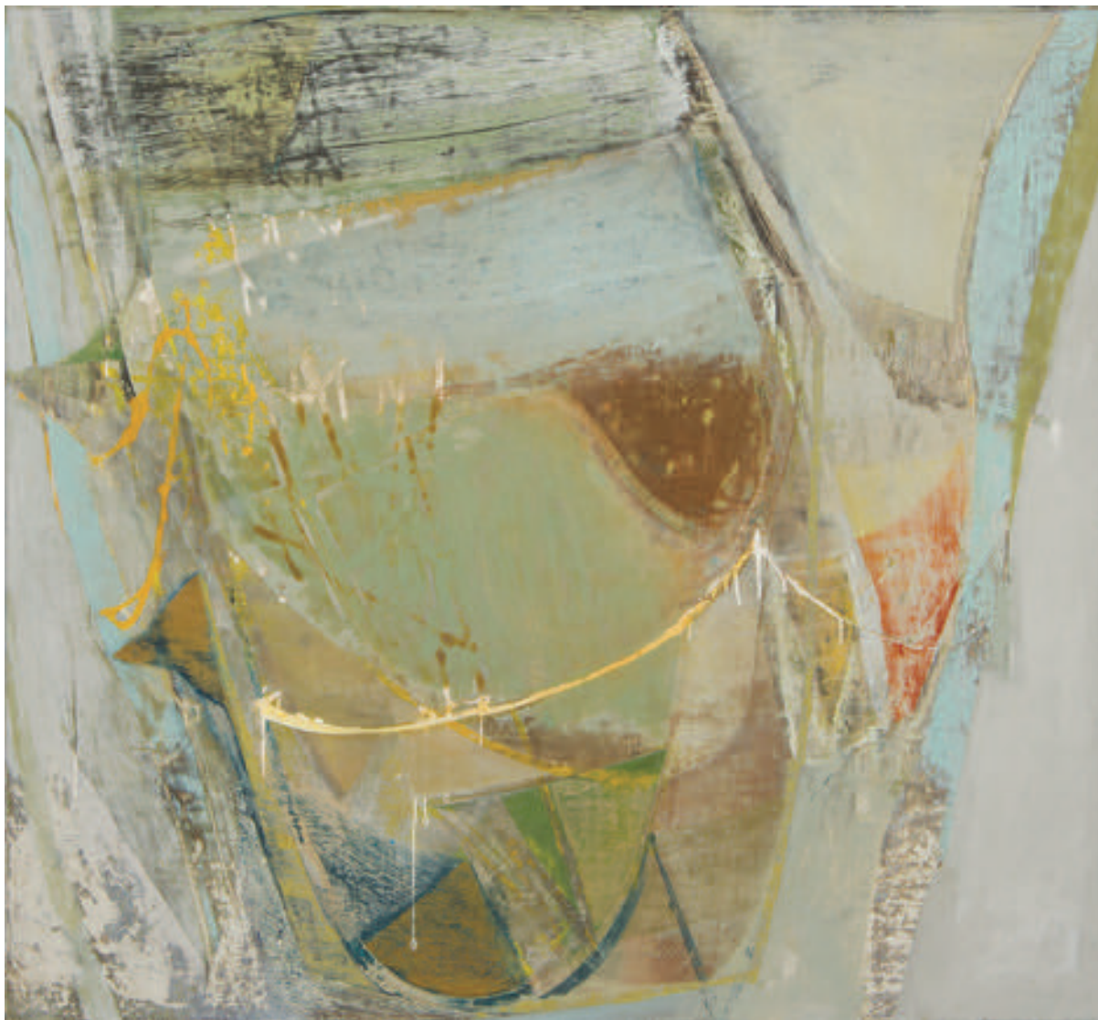
4. Les Prés acrylic on board 92 x 100cm