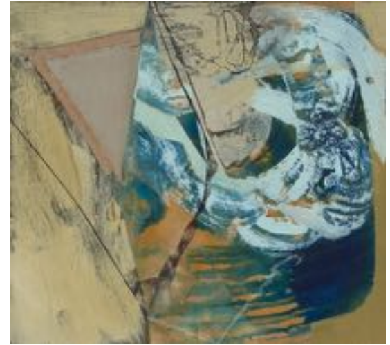
Dimpsey acrylic on wood panel 40.5 x 44cm

There's a nostalgia to these paintings but it's never mawkish or sentimental. Joyce's acute observation and eye for detail are the stuff of Proustian memories. The stone, the bit of wire, the wooden post act as catalysts into his creative imagination. He admits he would rather go back into the past than forward into the future. That when making a painting he discovers his place in the natural world, in the historic scheme of things. It's often only after a work is finished that he realises what it is about.