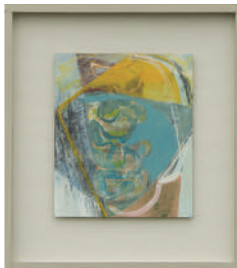
2. Wedge acrylic on board 28 x 24cm