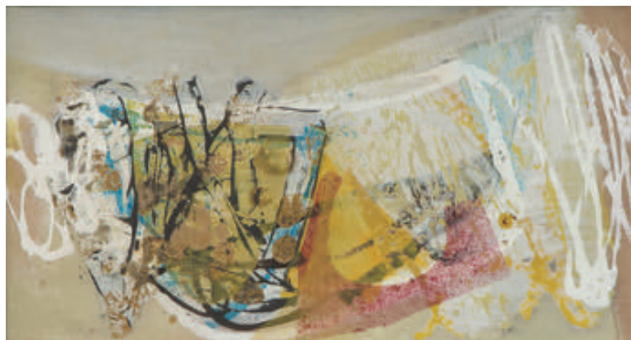
20. Morning Chill acrylic on board 21 x 39.5cm