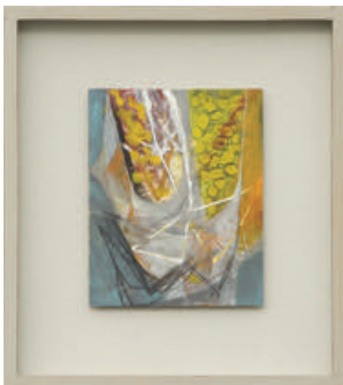
1. Yellow Forms acrylic on board 23 x 18cm