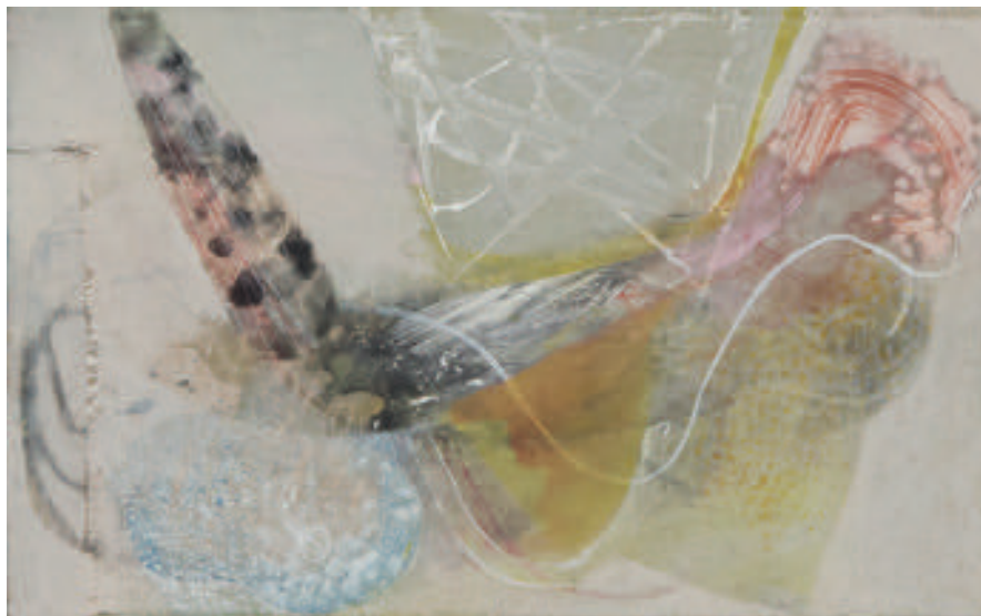
19. Traverse acrylic on board 28 x 44cm