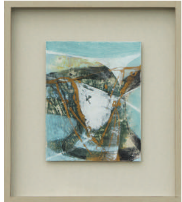
25. Centre Point acrylic and collage on board 25 x 20cm