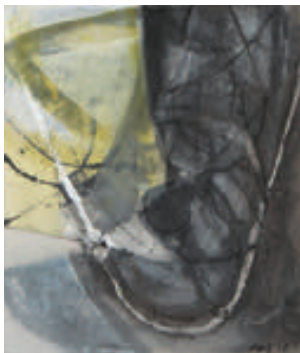
Thicket acrylic and collage on board 28 x 24cm

In other paintings it's not so much physical locations or topographies that have inspired Joyce but times of day, changes in light and, what the poet Wordsworth called, "emotion recollected in tranquillity". In Thicket , 2018, the mood is sombre, like the night closing in. The swirling veil of darkness that appears to be covering the touches of yellow speaks of those twin points in the life of any painter or writer, doubt and depression. While Blue Flash , 2018 suggests not only a dramatic streak of lightening across a wide sky but a burst of emotional energy like a clash of cymbals or roll of drums. It is in direct counterpoint to the stillness and introversion of Thicket , the buoyant side of creativity. Never static there's a constant sense of movement in these works. Things shift and change like the weather in this open landscape. Looking at this series of paintings is like listening to the flow of a piece of music with its diminuendos and crescendos, its moments of stillness and electric dynamism.