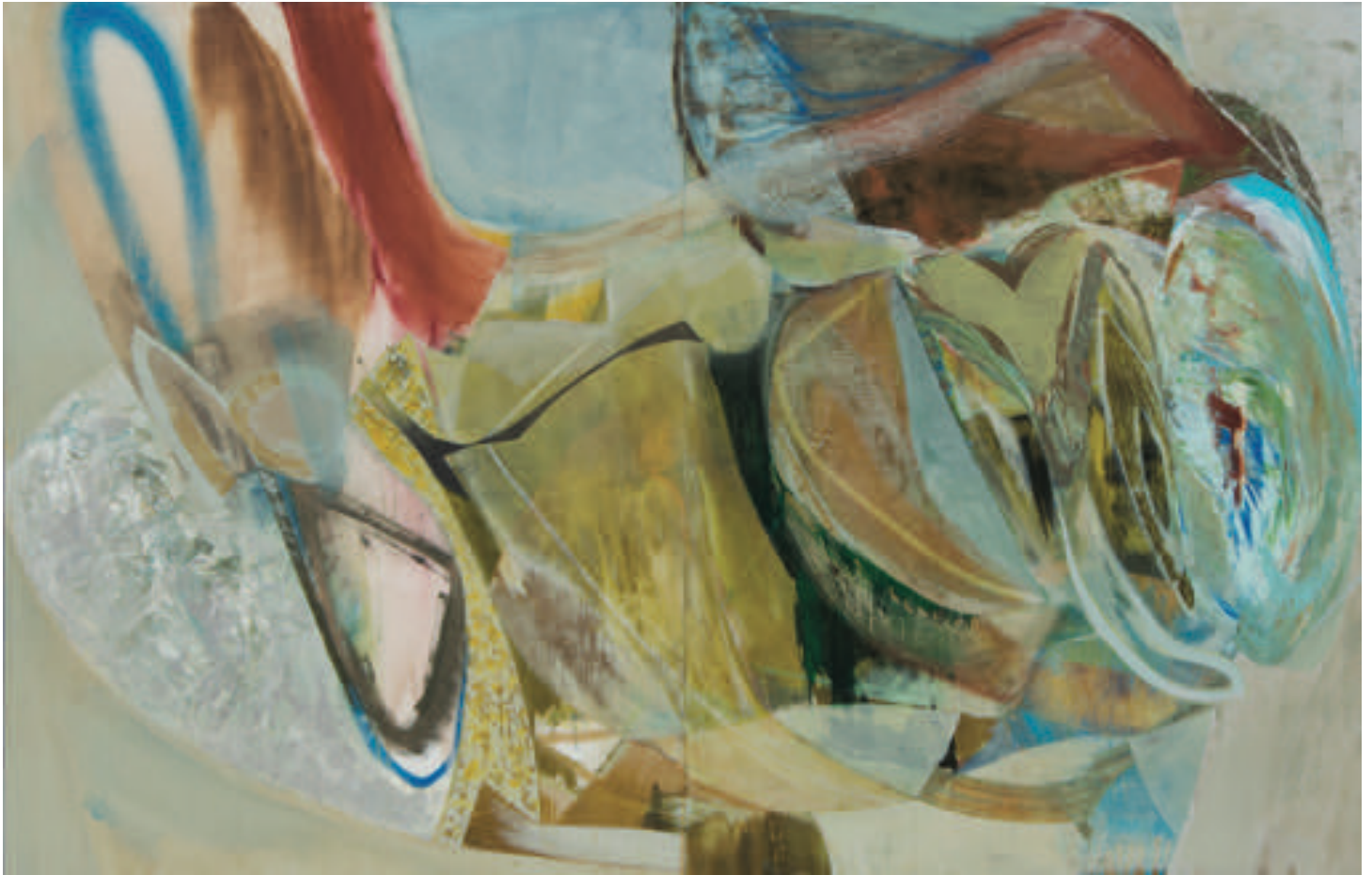
26. Terres Insolites acrylic on canvas 138 x 214cm