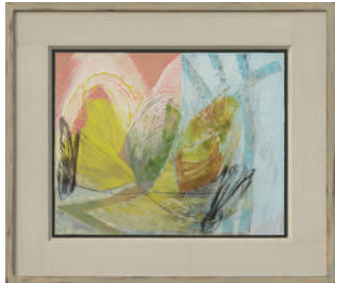
7. Orchard Entrance acrylic on board 30 x 38cm