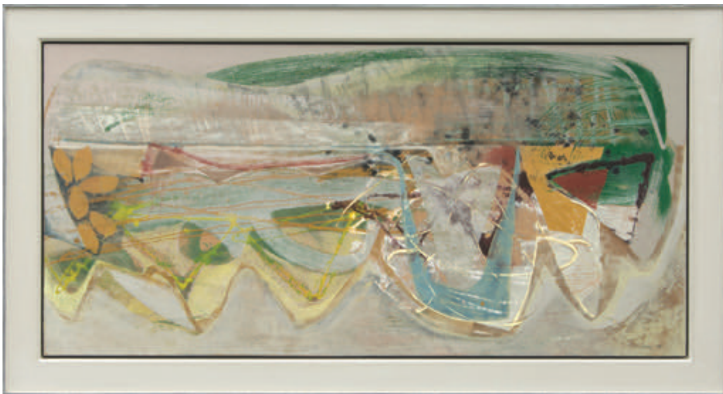
5. Lac du Jaunay acrylic on board 63 x 130cm