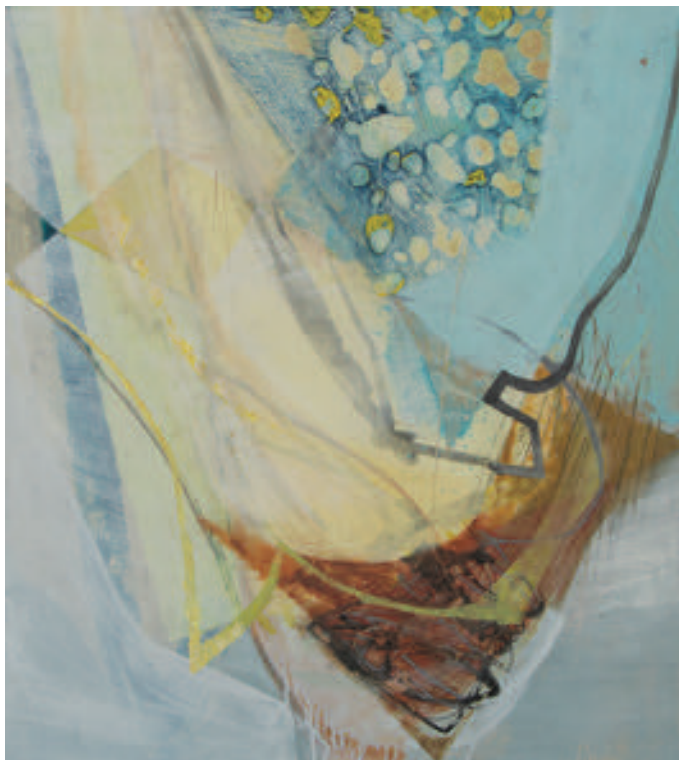
16. Tarifa acrylic on board 92 x 82cm