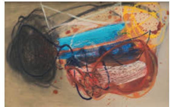
Blue Flash, acrylic on board 27 x 43cm