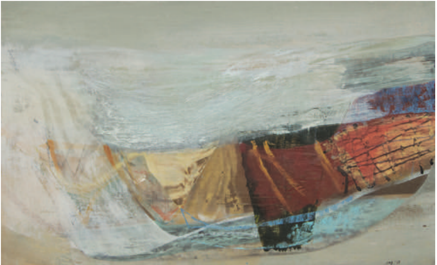
13. Tide Route acrylic on canvas laid on to board 63 x 104cm