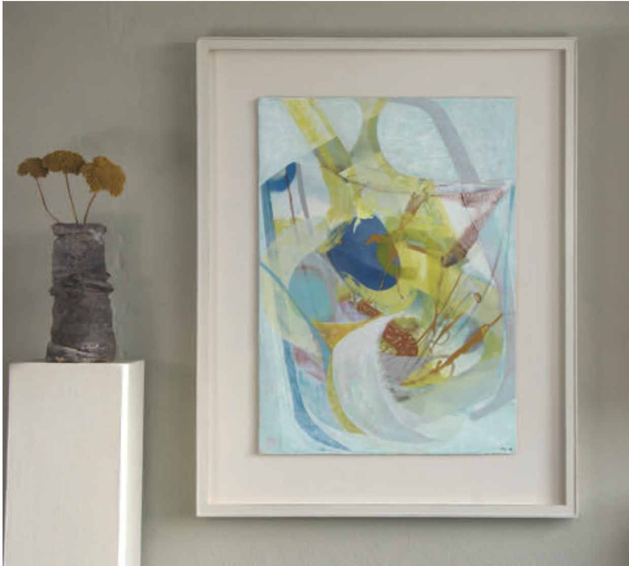
18. October acrylic on paper 77 x 56cm