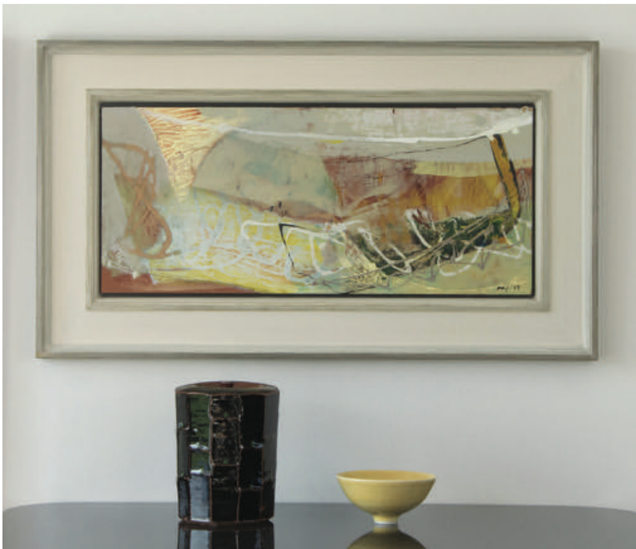
23. Plage du Midi acrylic on board 26.5 x 61.5cm