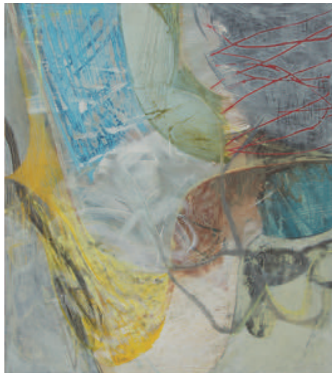
17. Red Streamers acrylic on board 92 x 82cm