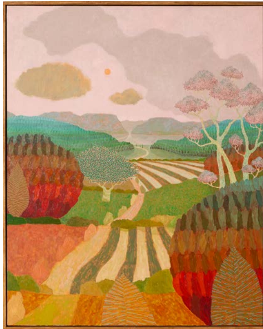
Last Light Through Green Valley, 2025