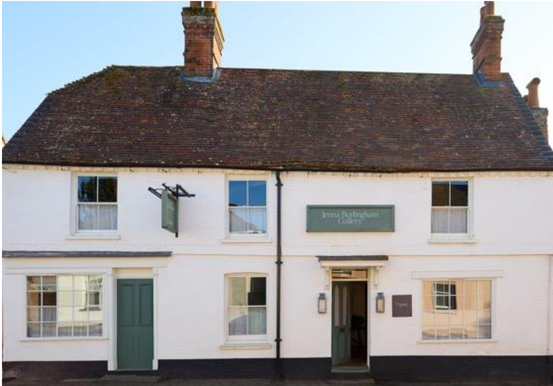
Jenna Burlingham Gallery.