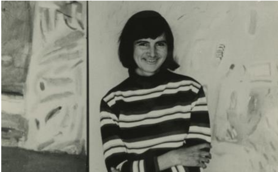
Elizabeth Blackadder photographed by John Houston, 1968