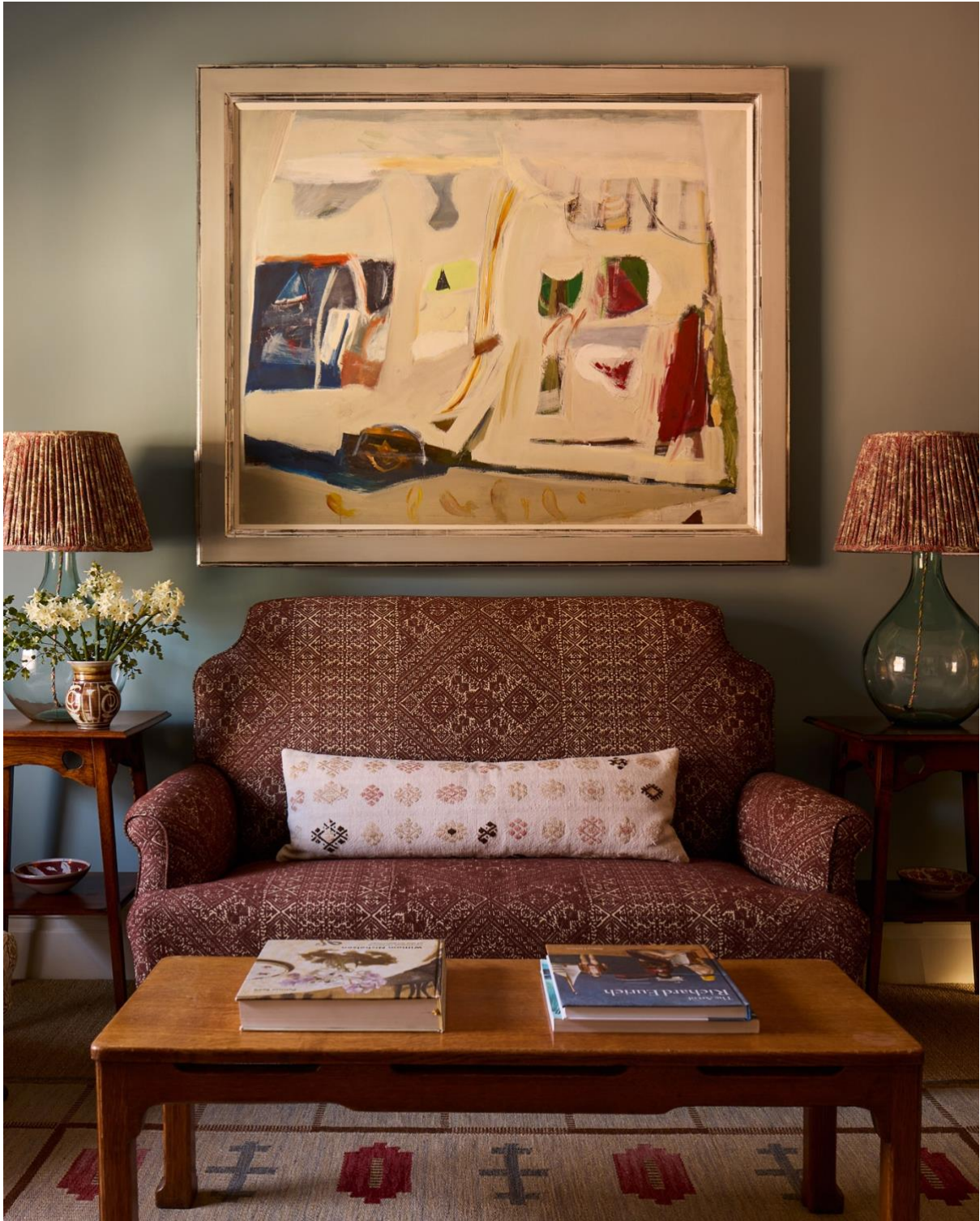
White Studio Table , 1966, oil on canvas, 102 x 127 cm.