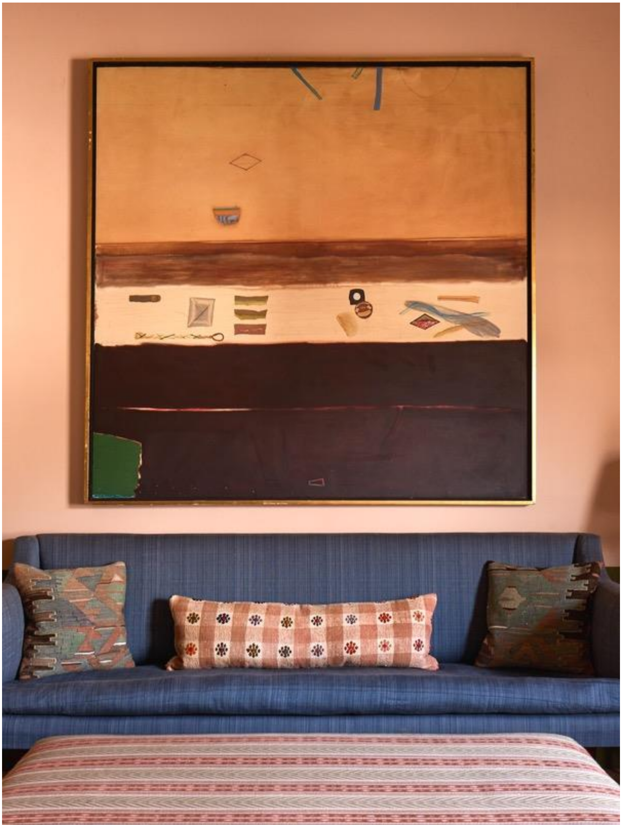
Still Life, Brown and White , circa 1975, oil on canvas, 153 x 153 cm.