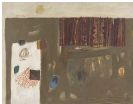
Still Life with Sea Urchin , 1963, oil on canvas, 86 x 112 cm