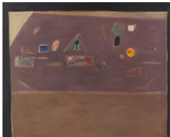
Still Life with Bead Bracelet , 1974, oil on canvas, 102 x 127 cm