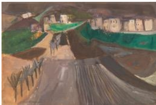
Landscape near Florence , 1955, watercolour and gouache on paper, 49 x 75 cm