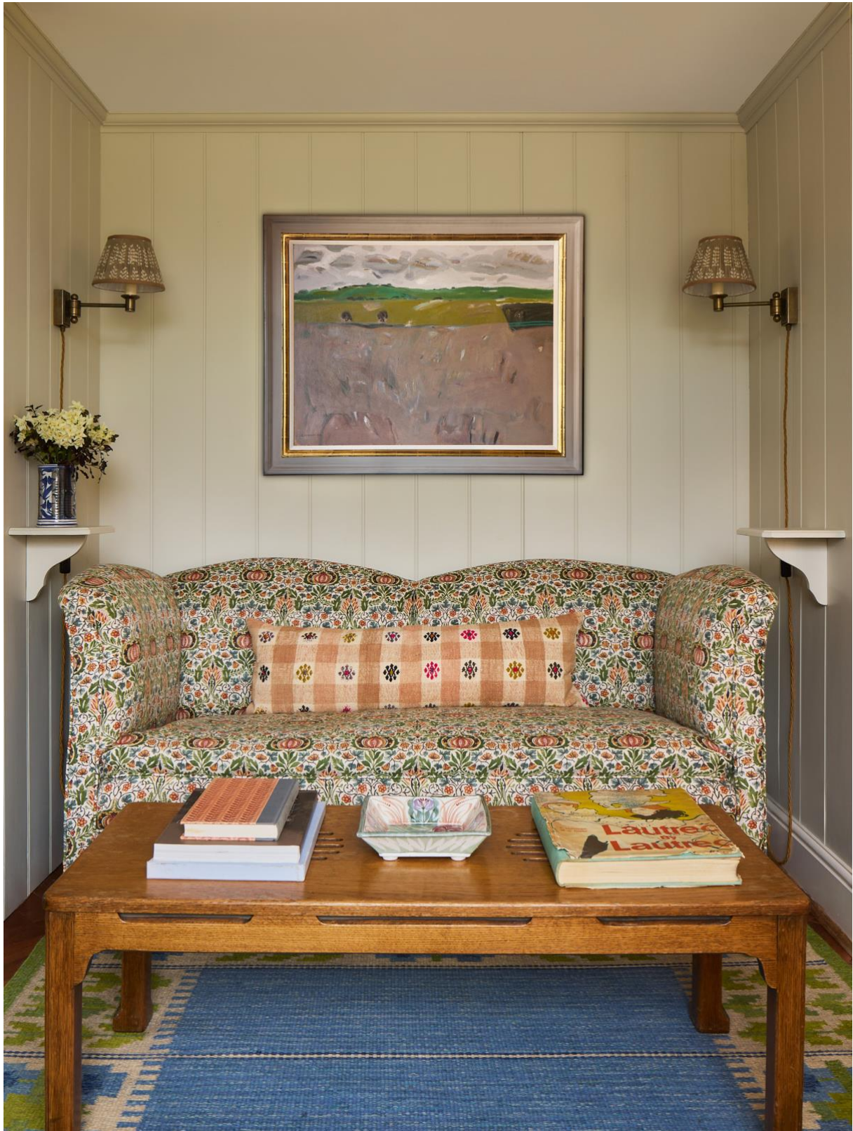
Borders Landscape , 1967, oil on canvas, 71 x 91 cm.