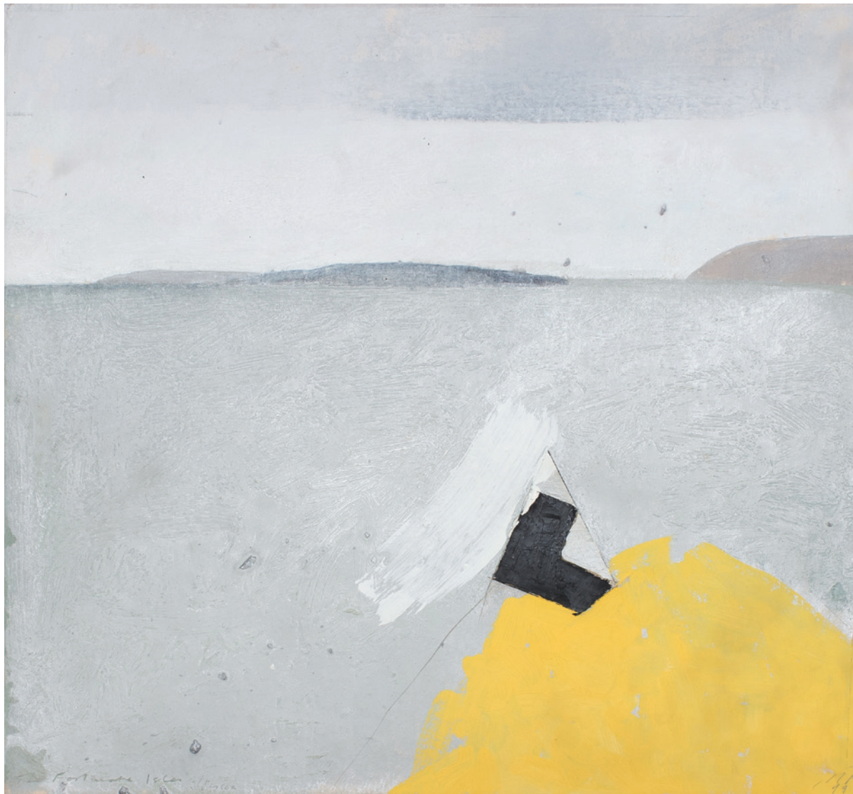
5. The Fortunate Isles (Pessoa), 1999 oil, sand and collage on panel 51.5 x 55.5cm