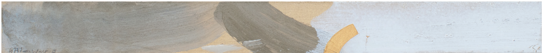
10. GoldenWalk II , 2015 oil and sand on panel 6.5 x 67cm