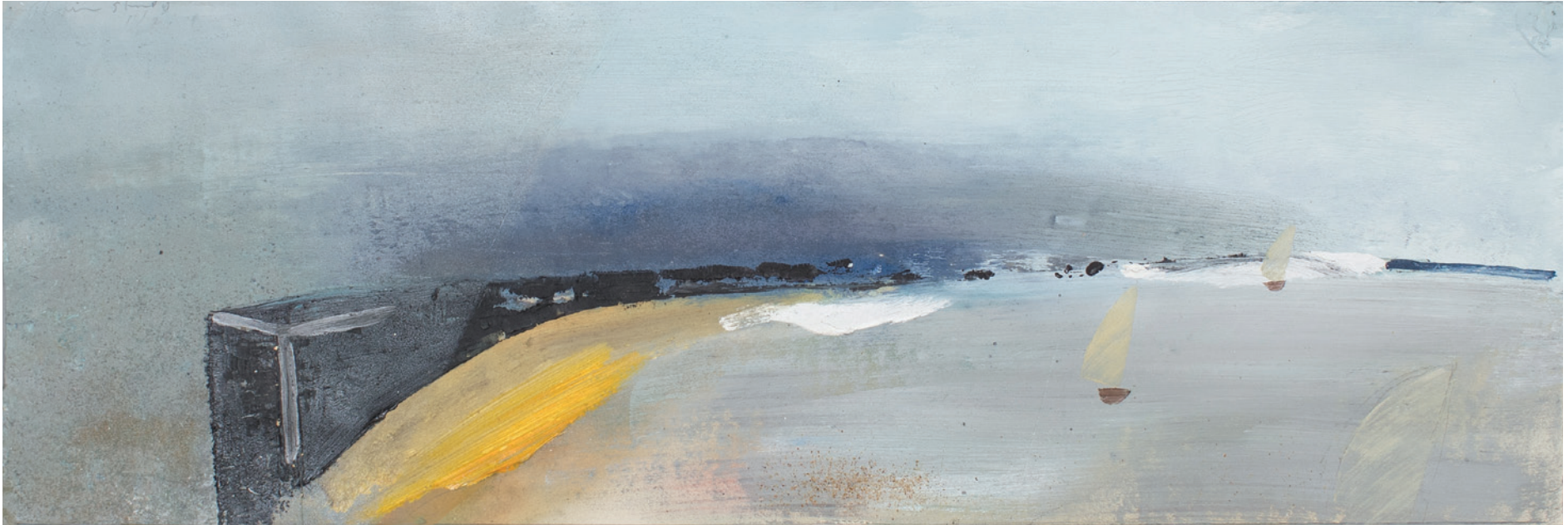
7. Rain Study II , 2014 oil and sand 26.5 x 78.5 cm