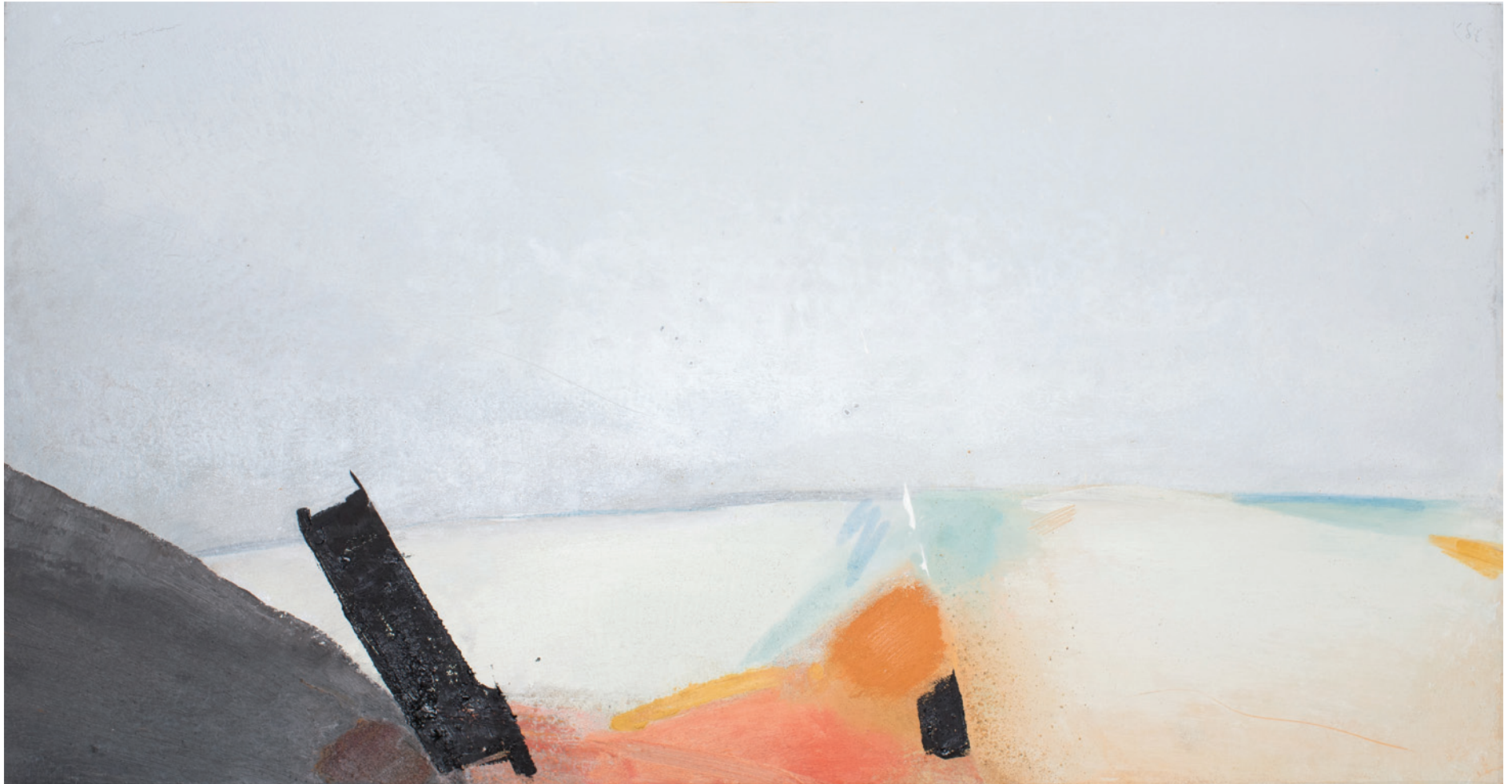
14. Found Harbour , 2002 oil and sand on panel 61.5 x 118cm