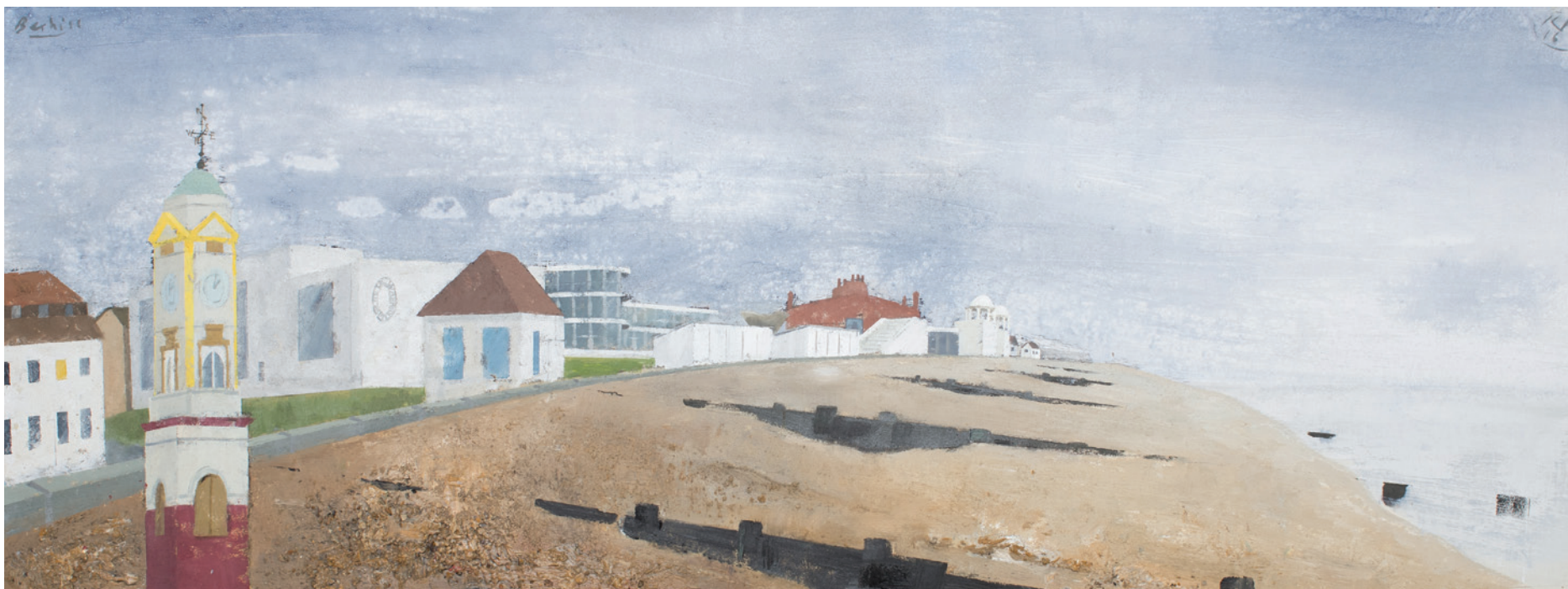
24. Bexhill , 2016 oil, sand and gravel on panel 42 x 114cm