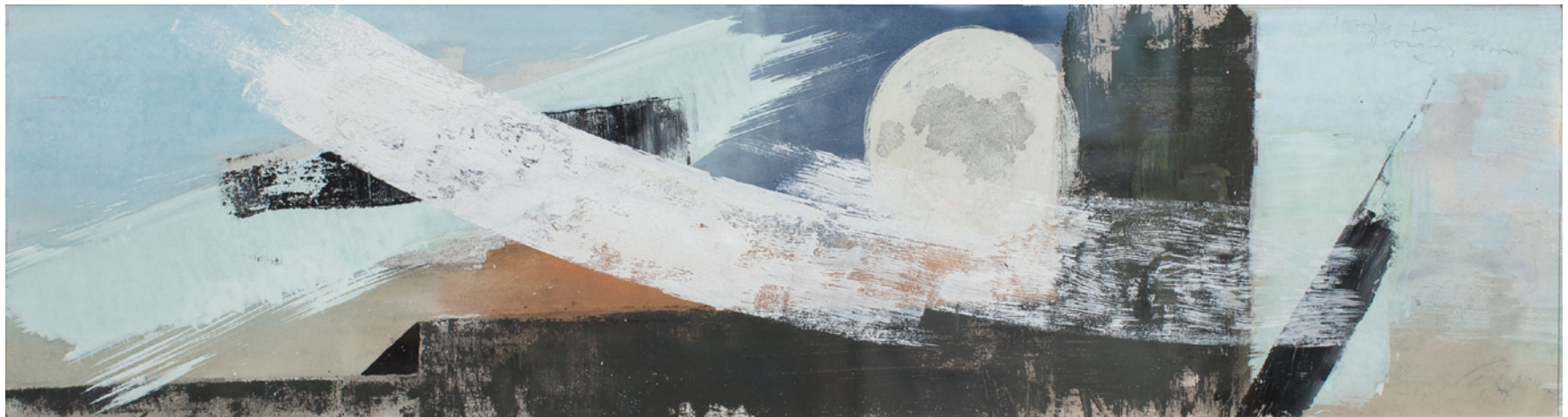
26. Study for a Drowning Moon , 2017 oil and sand 20 x 70cm