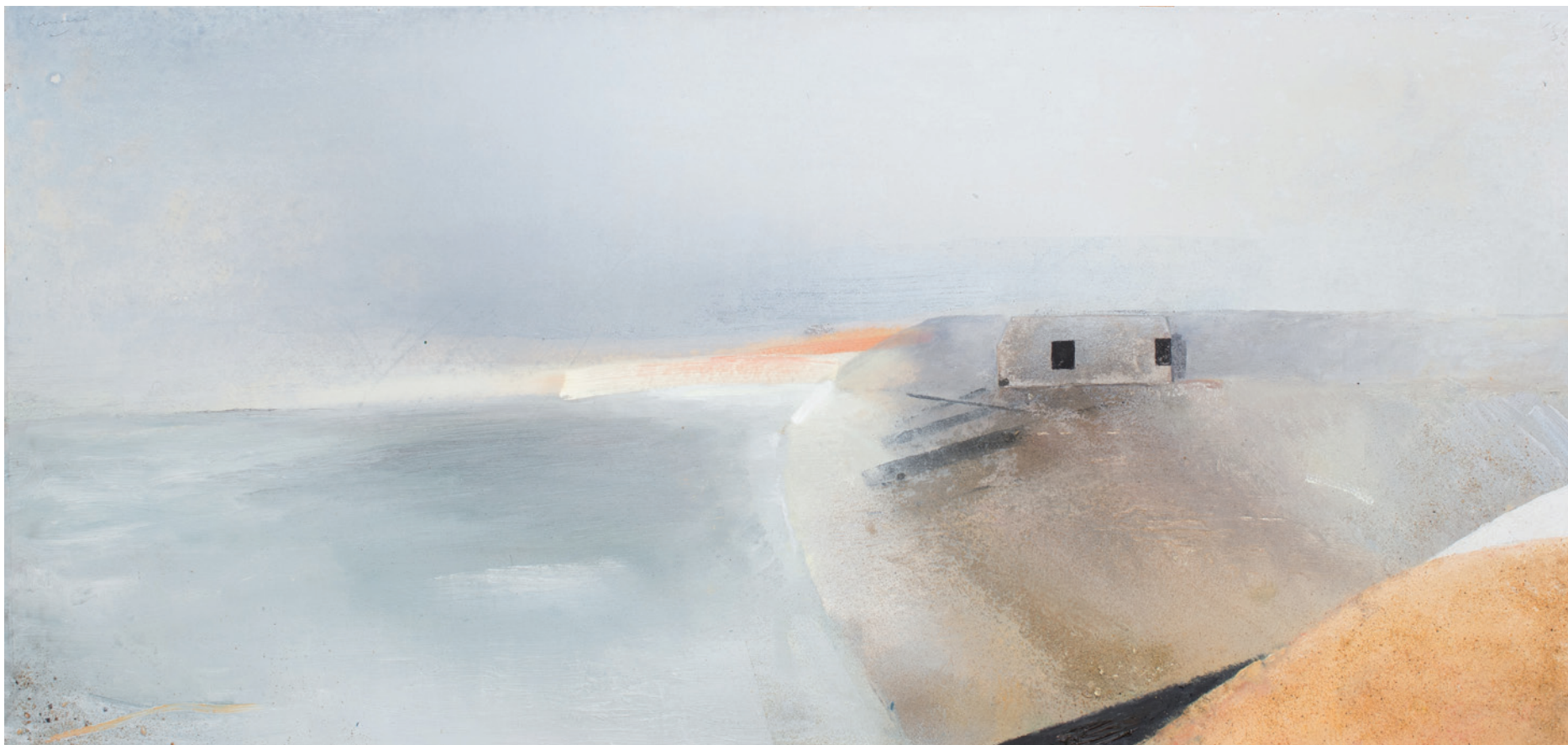
3. Sunrise , 1992 oil, sand and collage on panel 55 x 117cm