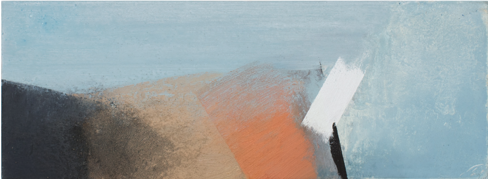
16. East Road (Orange) , 2007 oil and sand on panel 26 x 71.5cm