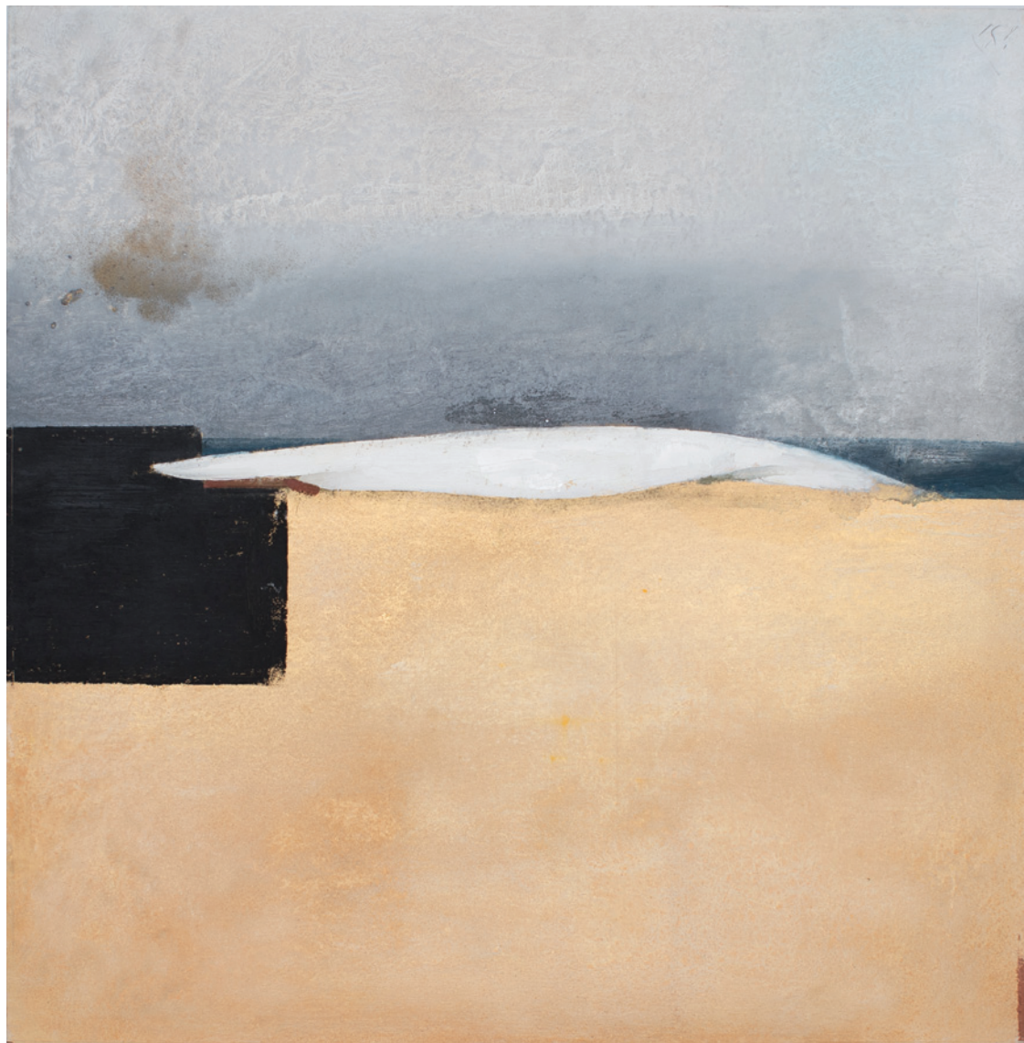
21. Wave 2 , 2001 oil and sand on panel 75 x 74cm