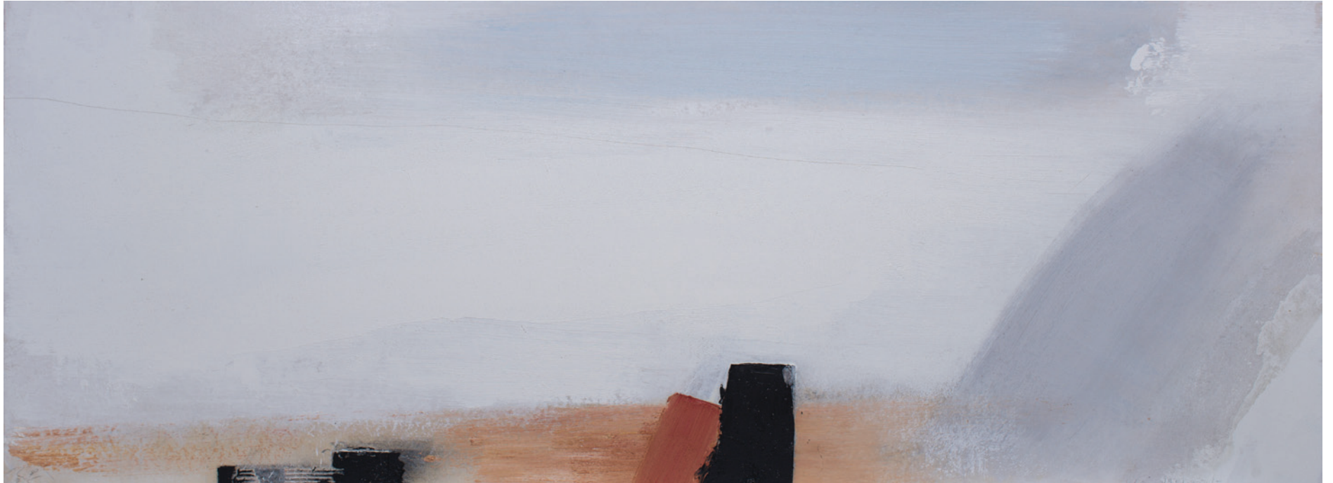
20. Windswept II , 2005 oil, sand and collage on panel 45 x 122cm