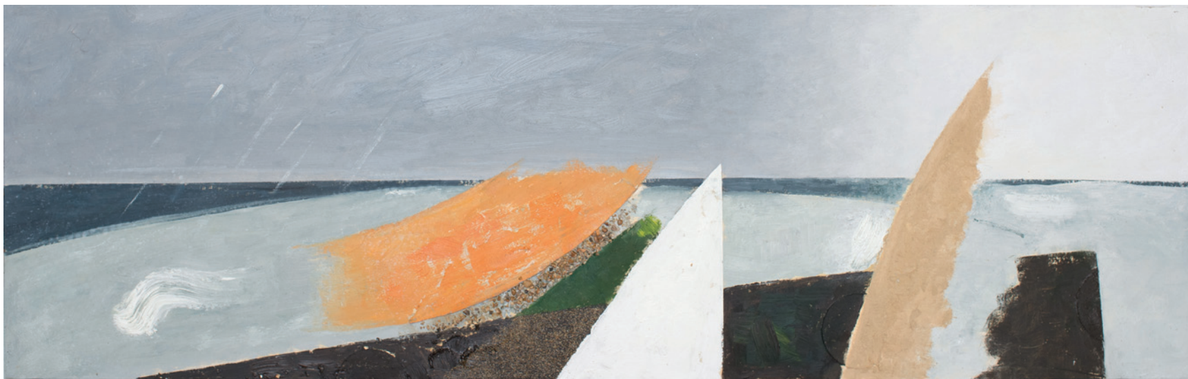
23. Summer Rain , 2012 oil, sand and collage on panel 38 x 125cm