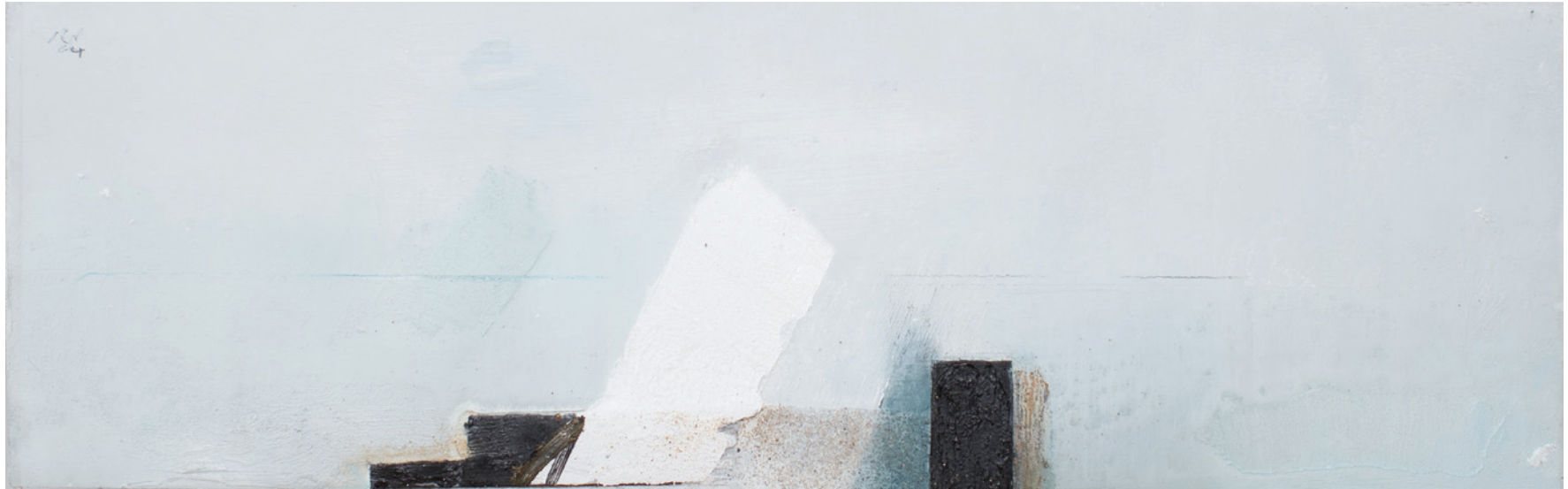
25. Breaker , 2004 oil and sand on panel 25 x 81cm