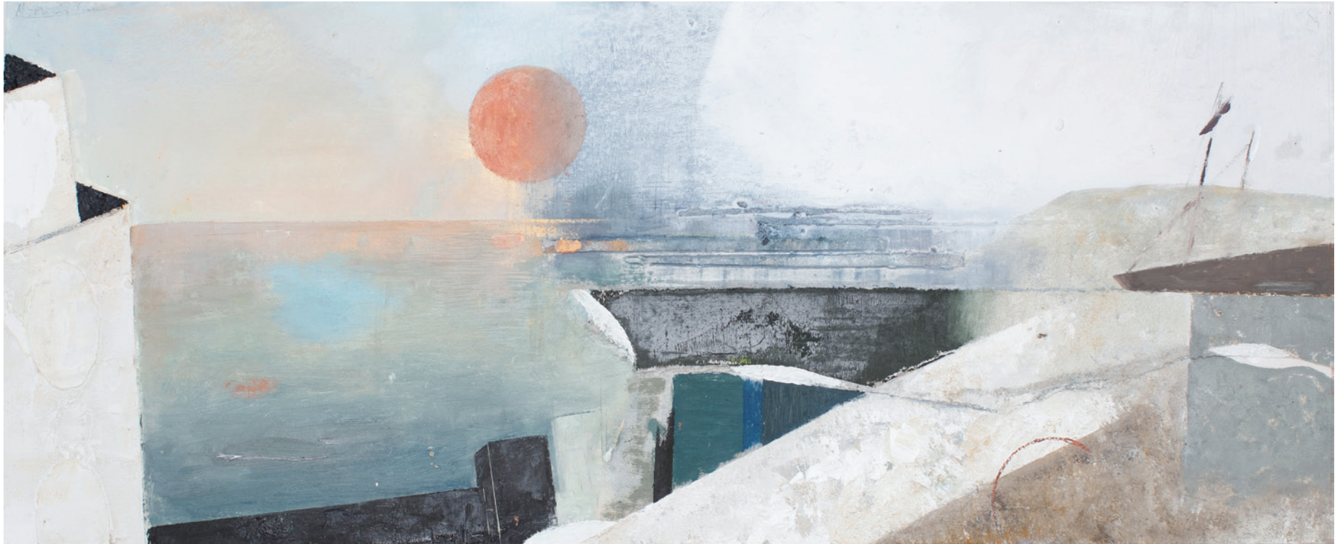
12. Morning Sun , 2017 oil, sand and collage on panel 41.5 x 101.5cm