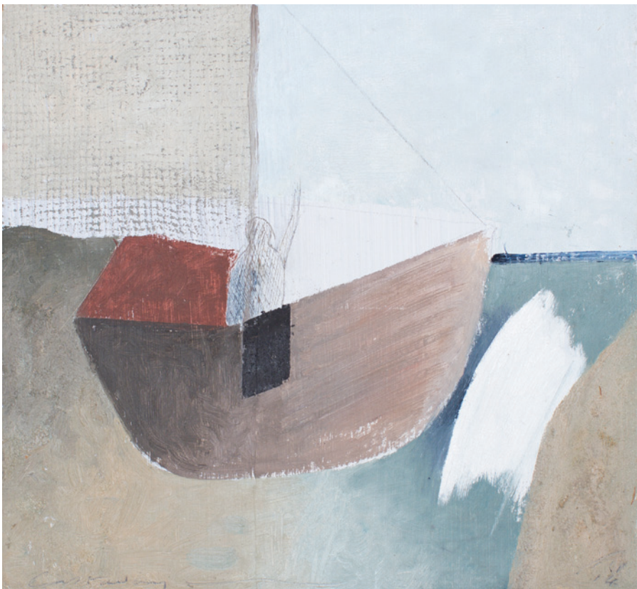
18. Castaway , 2014 oil and sand 35 x 38cm