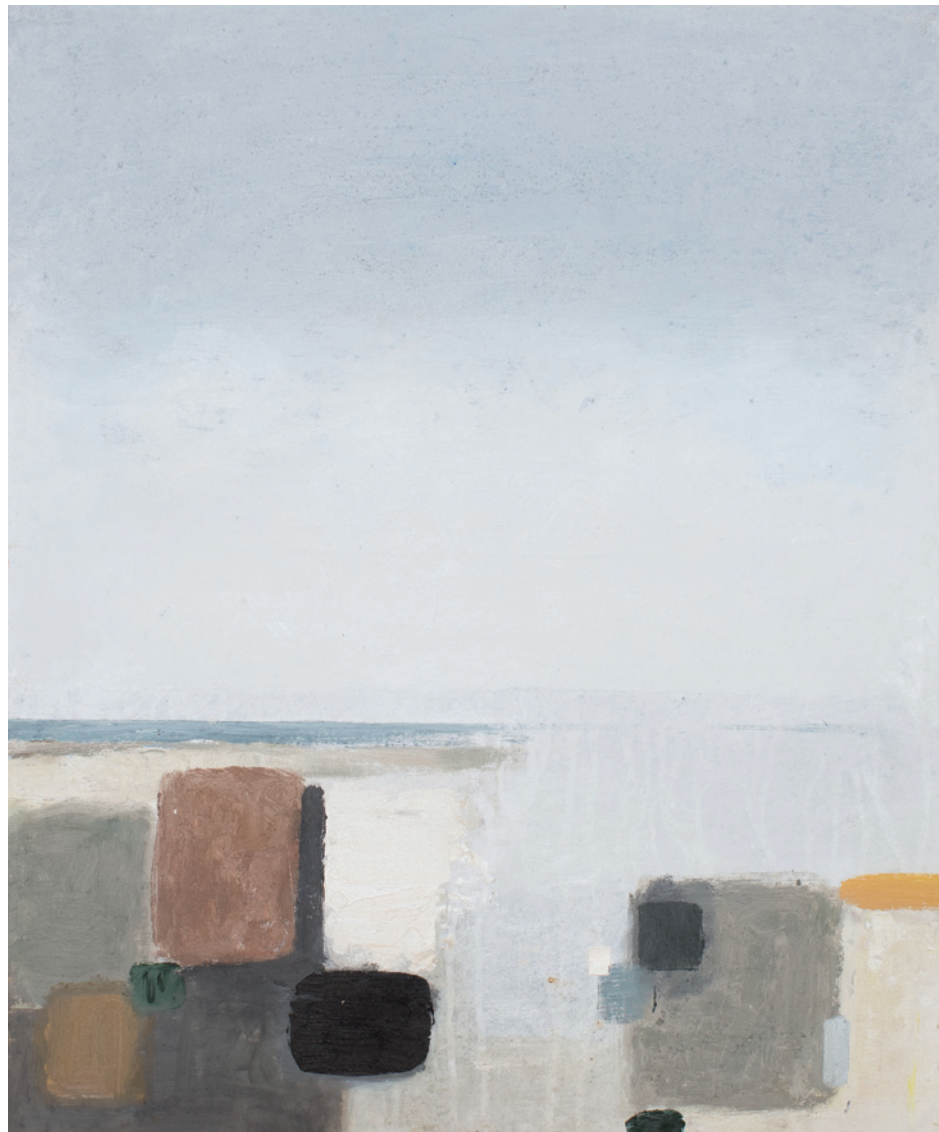
13. Inlet , 2016 oil and sand on panel 74 x 60.5cm