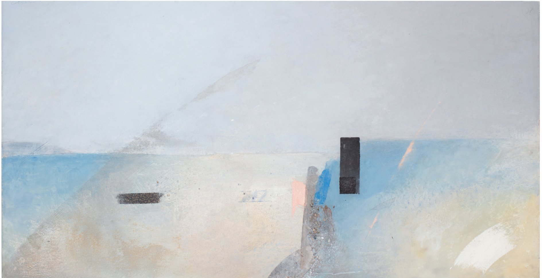
2. Crosswind , 2002 oil, sand and collage on panel 63 x 122cm