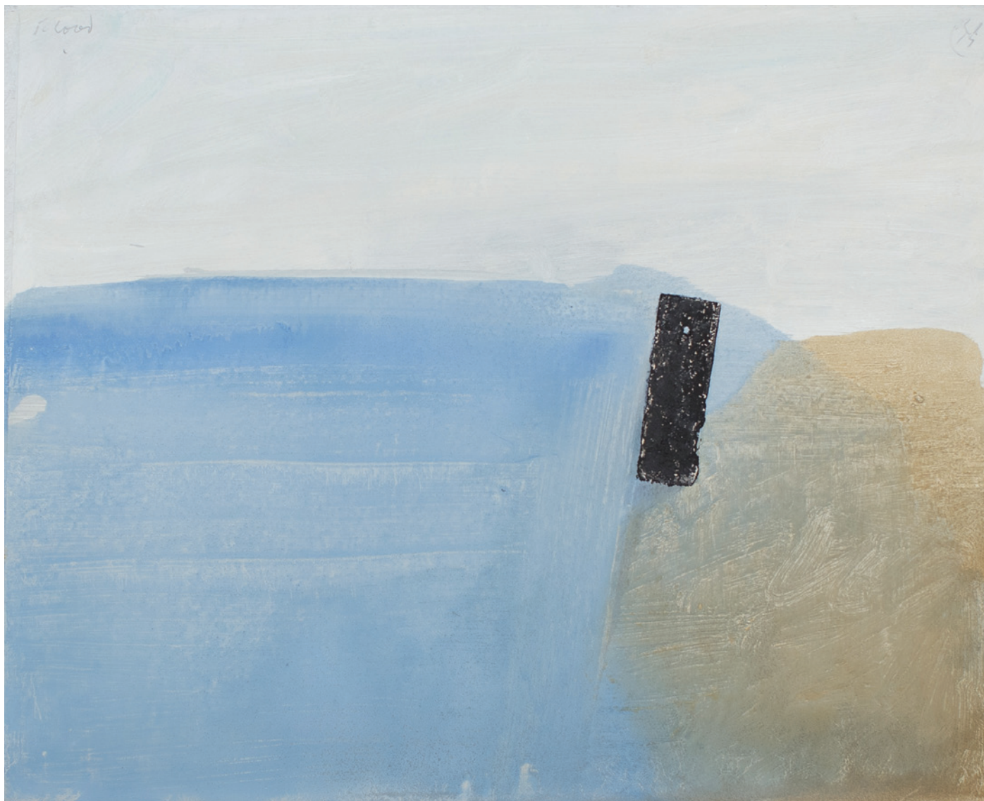
4. Flood , 2015 oil and sand on panel 40 x 49.5cm