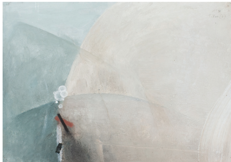
19. Tidal 9 , 1996 oil, sand and collage on panel 39.5 x 56.5cm