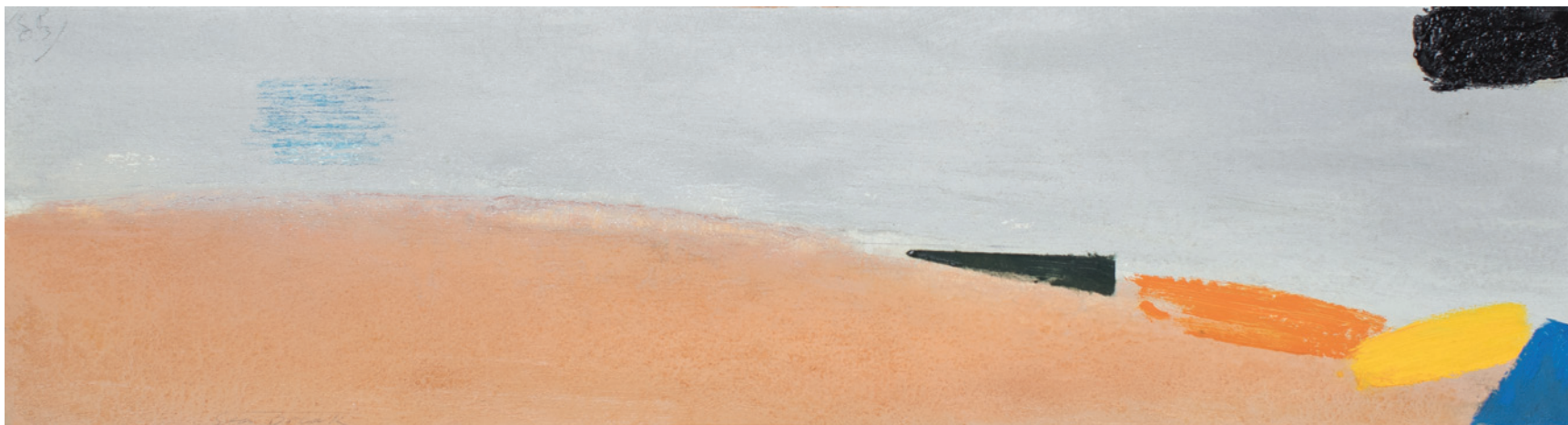
22. Sea Break , 2003 oil and sand on panel 27.5 x 105cm