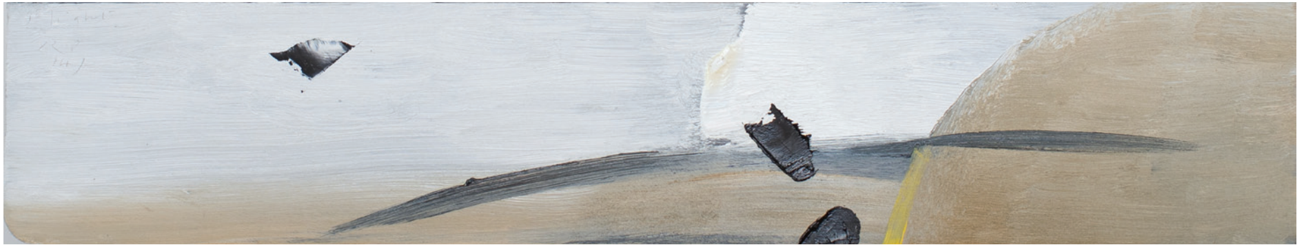
8. Flight I , 2014 oil and sand on panel 14 x 71cm