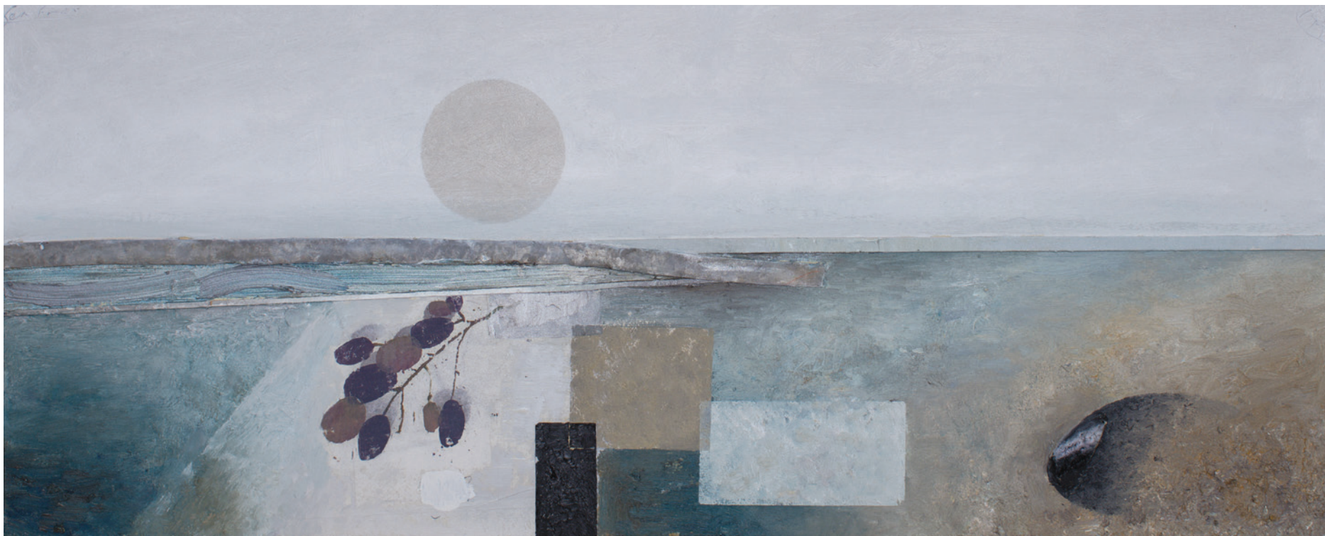
15. Sea Fruit , 2017 oil, sand and collage on panel 34 x 85.5cm