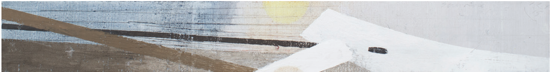
9. Sunrise II , 2015 oil and sand on panel 10.5 x 80cm