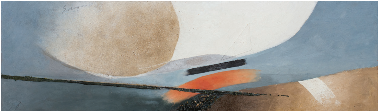
17. Sargasso , 2012 oil, sand and collage on panel 25 x 85cm