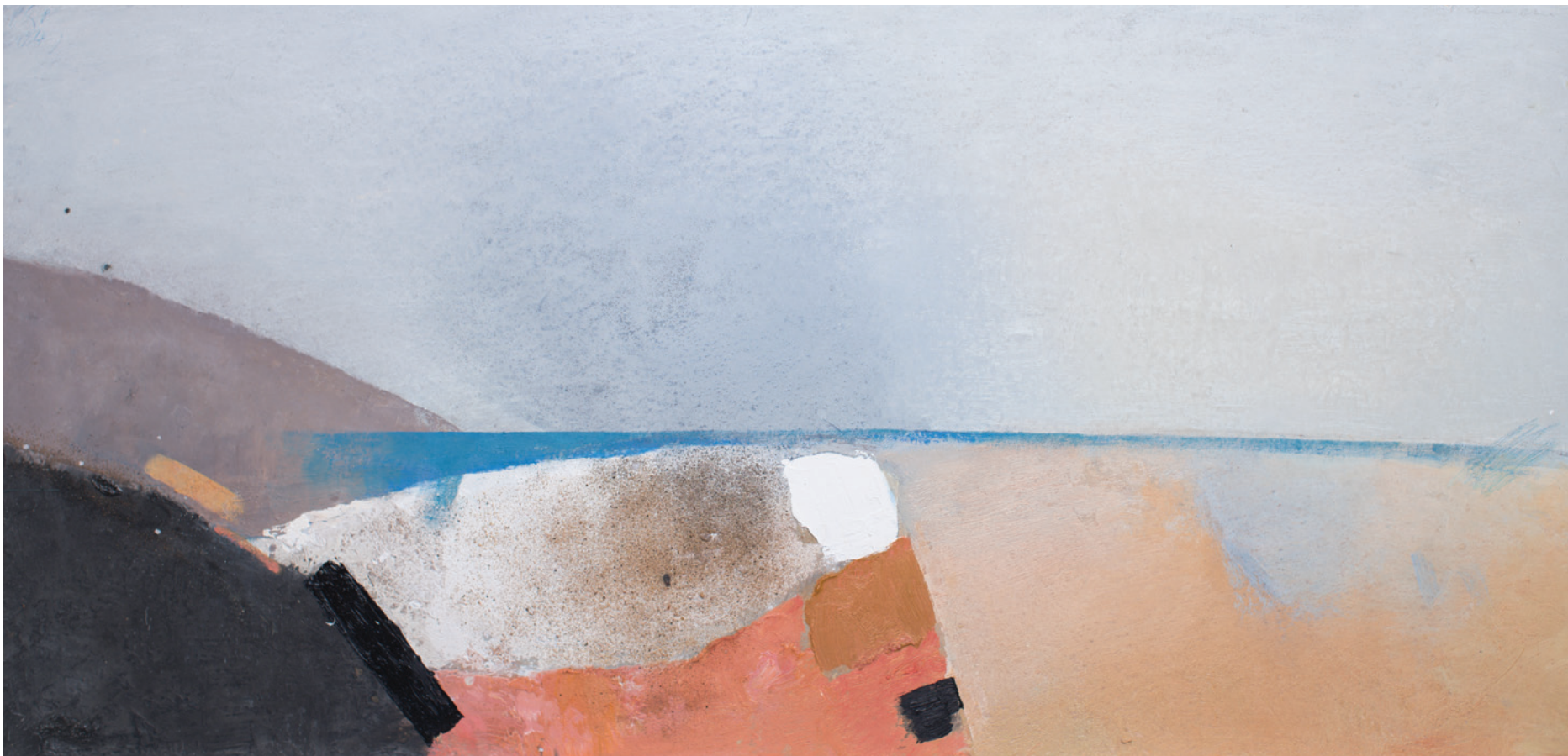
1. Distant Blue , 2004 oil and sand on panel 58.5 x 122cm