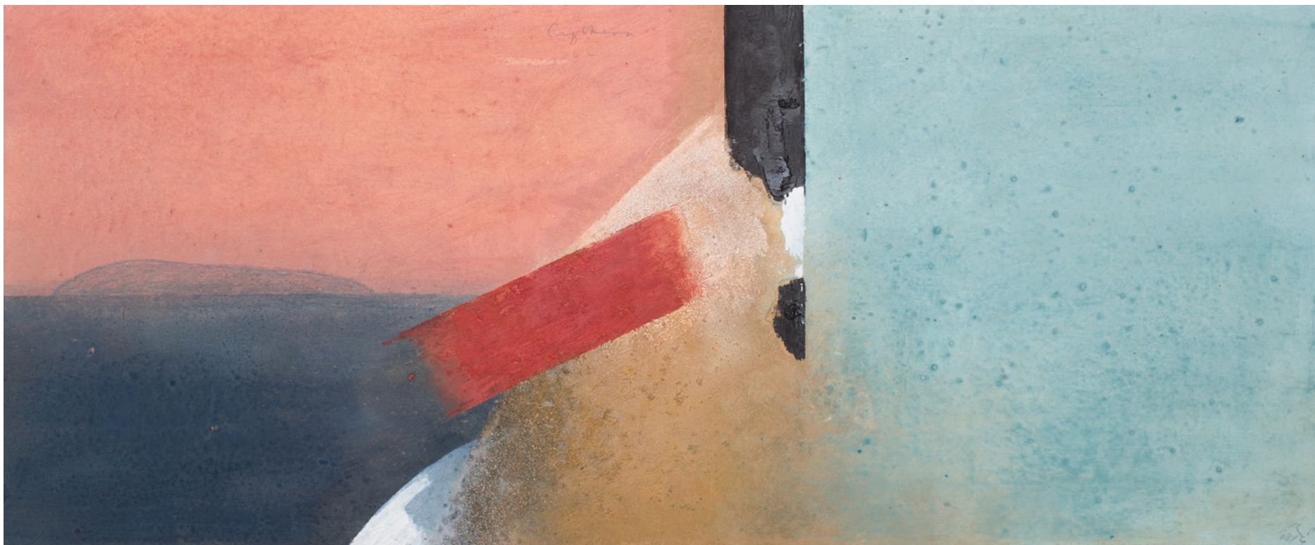
11. Cythera , 2014 oil and sand on panel 36.5 x 89 cm