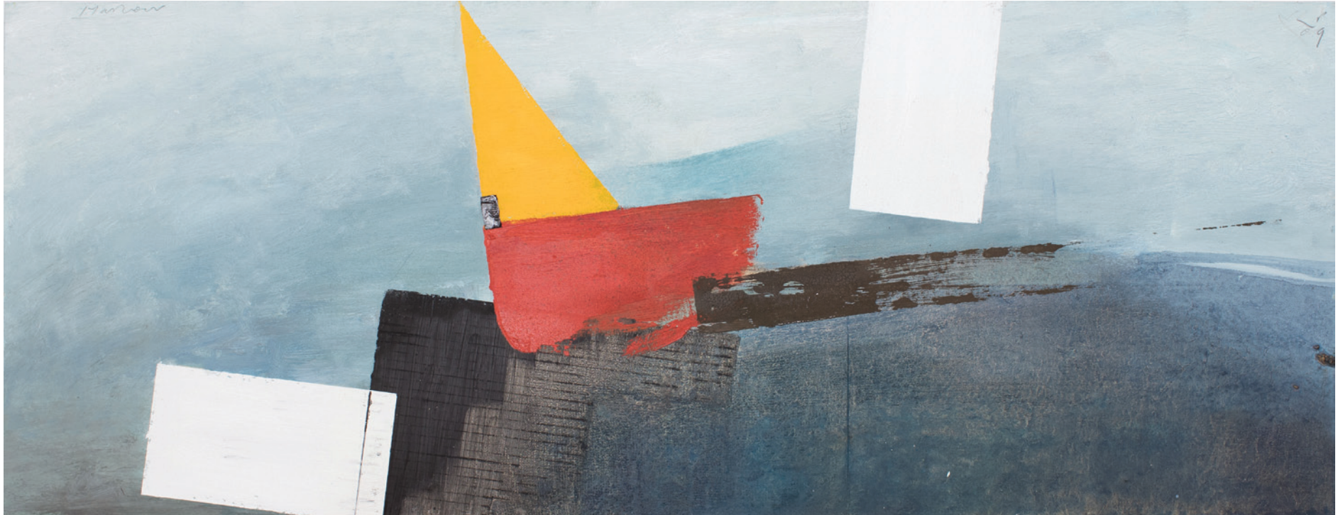
6. Harbour , 2009 oil and sand on panel 38 x 99cm